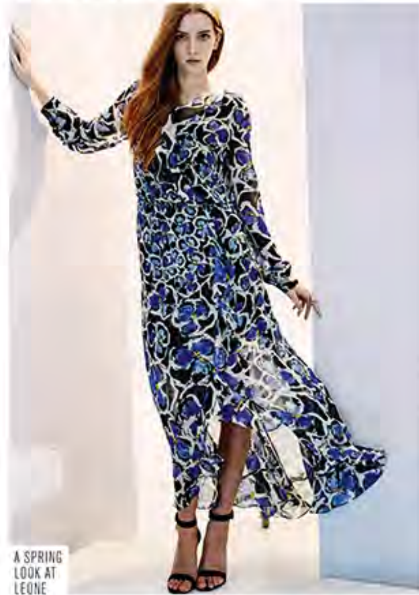
A SPRING LOOK AT LEONE

differ," she says. You're also getting good value, she adds, as you can wear the two pieces separately with different outfits. "We've been seeing a lot of the maxi skirt, and not just paired with a crop top. A sleeveless turtleneck in viscose or silk works, too," says Lerner. "Another new look is a soft, draped-front narrow pant with a sleeveless blouse." For dinner or an informal wedding, opt for a wide-leg trouser paired with a lightweight sparkly sweater. "This spring, pants are much fuller and wider—a great look is a wide pant with a short jacket," says Oppen.