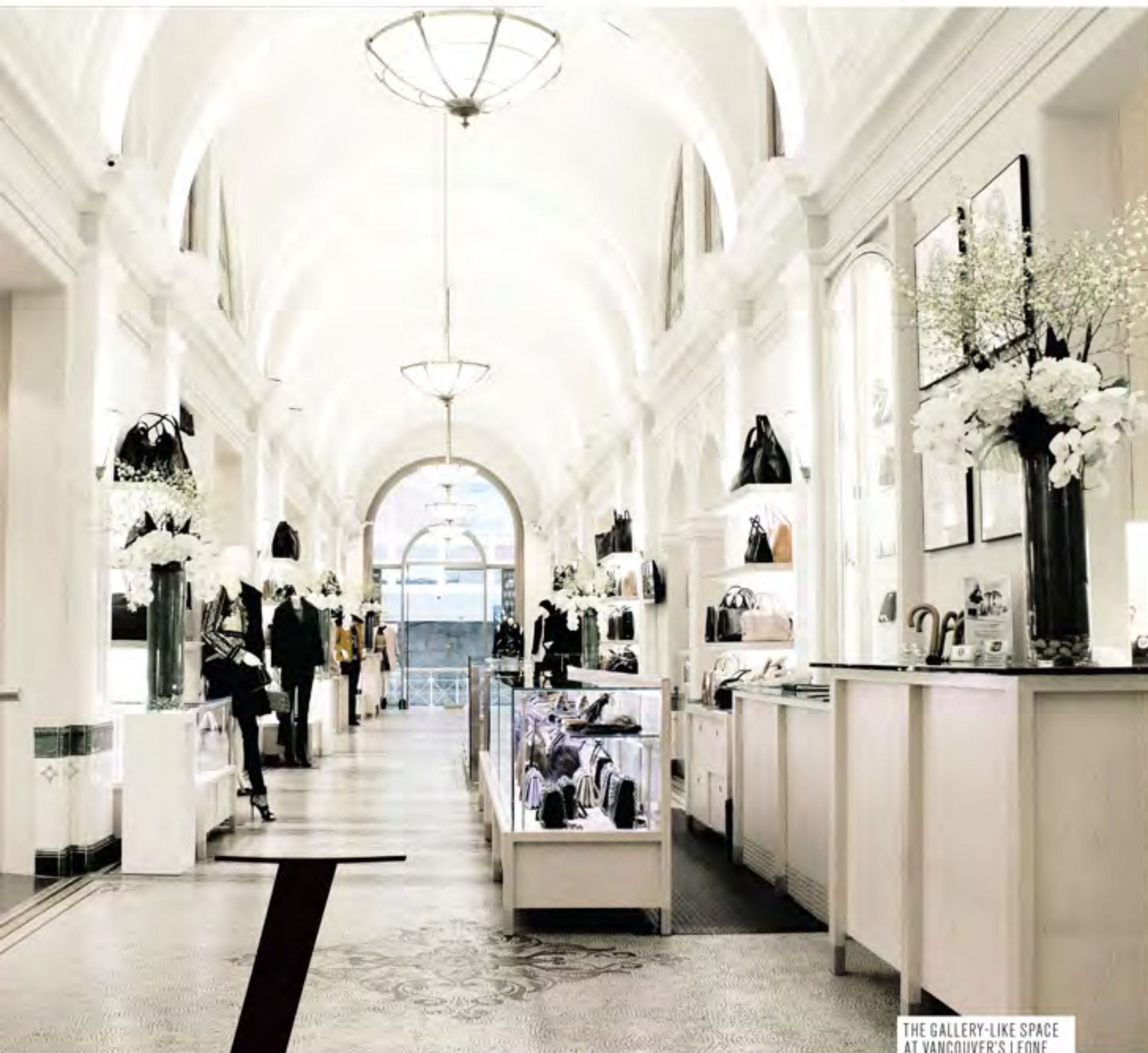
THE GALLERY-LIKE SPACE AT VANCOUVER'S LEONE

I don't often attend red carpet events (OK, never), but I did walk down a reddish carpet once. It was my then-boyfriend's high school prom, and in my small hometown it was tradition to parade into the event amid flashing cameras as smiling parents, tearful grandparents and gawking friends cheered us on. It was by no means the Met Gala, but in my white column dress, featuring a front-slit skirt and tonal sequins on the bodice, I sure felt like an A-lister. But these days, Hollywood's leading ladies aren't just reaching for those tried-and-true columns. The award season's best-dressed lists highlight everything from traditional (strapless) to trendy (jumpsuits). The lavish gown is still an evenin-